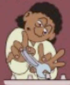
Lack of co-ordination