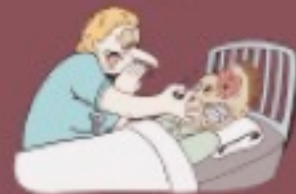
Lack of concentration